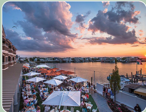
Stone Harbor